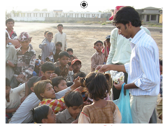
Sports ministry - in Pakistan

In Pakistan, everyone likes sport – and that's an understatement! So it was natural for the sports team to get alongside young believers in Jesus who want to grow in their faith and are serious about sport, by offering cricket coaching in two separately located academies where sport and Biblical values work hand in hand: encouraging physical and spiritual development. In the same way, the team encouraged children in a small village they regularly visit, to play cricket, using bats and balls they donated to the community. Pray that sport will unite players as believers.