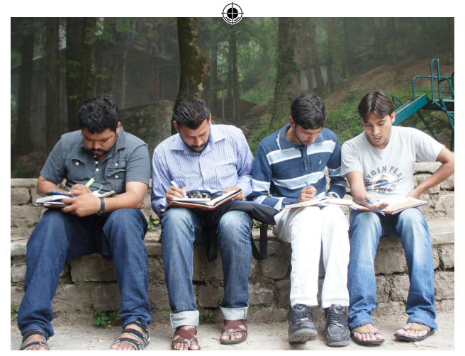
National staff - in Pakistan

Each member of OM Pakistan begins by coming for a few weeks to serve with other team members, returning to go on camps and outreach. As they grow in faith and understanding, so their experience of God in meeting their needs also develops. One team meets regularly with young believers to do Bible study, as other team members did with them. A church pastor said: "I am pleasantly surprised to see the positive change in our youth, now being more responsible and diligent. God bless you, as generous facilitators!" Pray national staff inspire others in following Jesus.