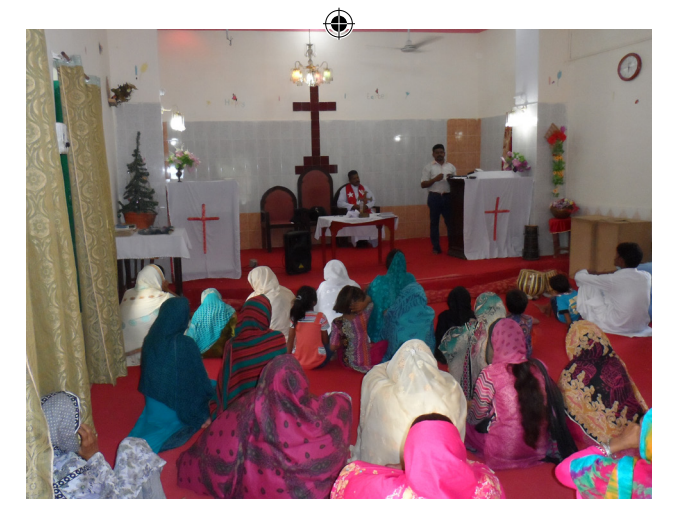
Building up the church - in Pakistan

Teams from OM Pakistan go regularly to visit people who live in the Christian quarters of cities and towns throughout Pakistan, as part of their ministry to build up the church, and reach out to families who may be isolated and in need of encouragement and prayer. Very often, families have a general belief in God but not a personal relationship with Him. One family the team visited called themselves believers, but did not know God's Son. The team was able to tell them about Jesus, and encourage them in the Truth through God's Word. Pray for nominal church goers.