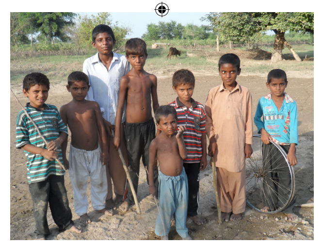
Relief & development - in Pakistan

In September 2014 the monsoon floods devastated vast areas and communities. The team was able, once floodwaters had subsided, to visit areas where they already had relationship, bringing essential food and goods. Families were so grateful to see them. A mother carrying her disabled son, explained: "We had made special shoes for him so he could walk. But, around midnight, when floodwaters overflowed the bank, I could only snatch him up and run as quickly as possible; there was no time to find his shoes. So now he cannot walk about." Pray for the communities.