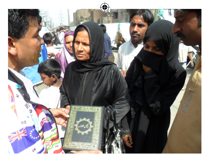
Sharing literature - in Pakistan

As the team set up a book table, the local religious leader, or molvie , was openly interested and willingly took a book about the life of Jesus. Other molvies gathered and asked many questions about God, greatly encouraging the local believers. Another molvi said he ran a religious school, or Madrassa , so already had many books. A team member talked to him about passages from the Qur'an, explaining Christian literature could give him more knowledge about the reality of God. Pray for literature and other media to impact many to learn more about God.